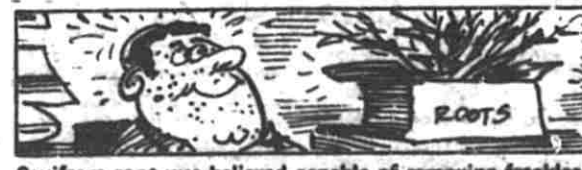
Saxifrage root was believed capable of removing freckles.

team was honored for their accomplishments at a special 4-H Horse Jamboree awards breakfast at MSU's International Center, April 27. Because of the American electoral system, the Presidential candidate with the most popular votes is not necessarily elected President. Henry Ford Museum's "Politics U.S.A.," which continues through Labor Day in Dearborn, Mich., looks at the campaigns throughout the nation's history, including those of the three men who won the popular vote but did not gain the Presidency: Andrew Jackson, Samuel Tilden and Grover Cleveland. The winners respectively, were John Quincy Adams, Rutherford B. Hayes, and Benjamin Harrison.