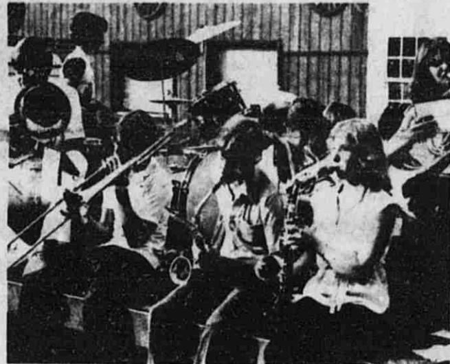
Lowell Senior High School's Pep Band becomes the Showboat Band for a week each year and provides the sprightly music as the Robert E. Lee glides down the Flat River each night of Showboat Week. Ensnared on a flat-bed truck from Wittenbach's, the Showboat Band led the Grand Parade on Monday night.

This is certainly not the year to miss the Lowell Showboat.