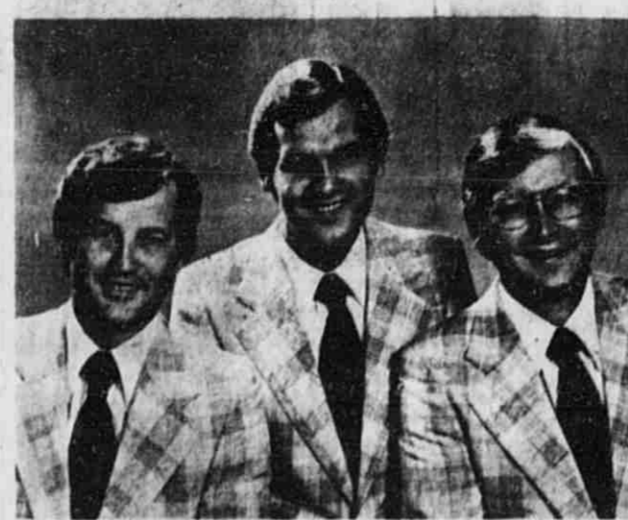
The Couriers, a gospel and sacred music trio from Pennsylvania, will be in concert Friday, May 11, at the Lakewood High School Gym. Area ministers will have tickets available for the singing.

The Couriers, a well known singing group of gospel and sacred music, will present a musical concert Friday evening, May 11, at 7:30 p.m. at the Lakewood High School Gym on M-50.