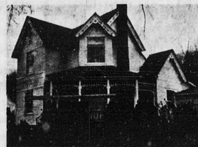
On the east side of Lowell is this Queen Anne-styled home with its Gothic trim, a real step into the past. Family heirlooms and antique furniture are gentle reminders of a gracious style of living from yesterday.