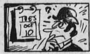
Enrico Caruso, the famous operatic tenor, was superstitious and would not start trips on Tuesdays or Fridays.