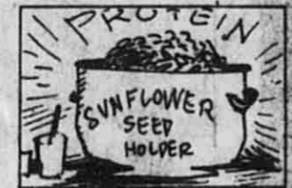
Sunflower seeds are a good source of protein.

There will be door prizes, golf prizes, etc. All alumni and guests are welcome. Reservations should be mailed to Lody Zwarensteyn, 2169 Timberwood, SE, Grand Rapids, MI. If there are any questions, please call 455-6123.