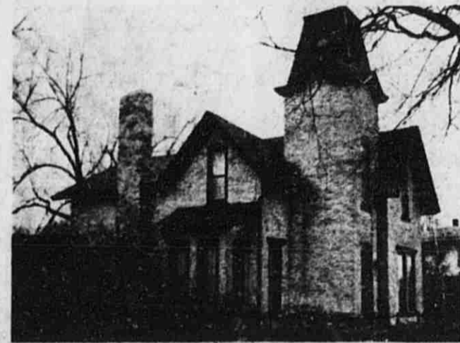
Five historic homes in Lowell will be opened to the public during the Historic Home Tour on Saturday, May 12. An ambitious project, it is the brainchild of the members of the Runciman-Riverside Parent Teacher Organization. One of the tour homes pictured above is located on Riverside Drive.

Overlooking the Flat River are two of the homes to be toured. The popular bungalow-styled home has been frequently visited by many politicians and Showboat celebrities. Jerry Ford has been just one of many to hold press conferences in the basement rooms. The upstairs was well designed to show off the antiques, and the windows on either side of the living room fireplace are brightened by the collection of colored glass. The owner has tastefully remodeled