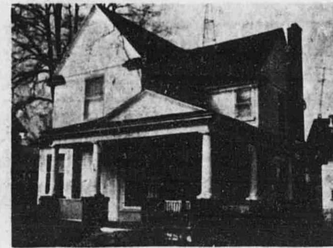
Another of the homes on the tour is located on Hudson Street. Tickets for the event are in the form of a booklet which gives historical information on the homes and Lowell, and will be sold beginning Monday, May 7, at the YMCA office [9 a.m. to 5 p.m.] and at the Showboat ticket office on tour day.