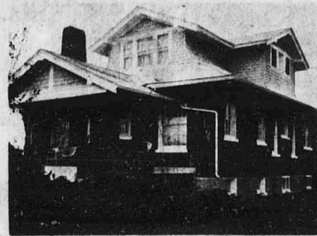
Also located on Riverside Drive, this home has seen some grand lawn parties attended by then-Vice President Gerald Ford and numerous Showboat celebrities over the years. Two hundred-year-old Lowell churches will also be open May 12, St. Mary's Catholic Church and the United Methodist Church.

BREAKFAST SPECIAL 2 Eggs, Toast, Coffee-99c c25