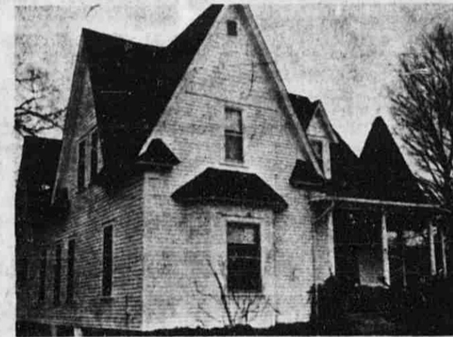
The turreted, windowed roof gives interest to a bedroom in one of the tour homes. Audi Post, who grew up in this house, was responsible for founding our city library.