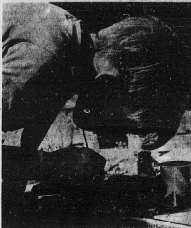
Craft projects are favorite activities at both of the Grand Rapids YMCA summer camps, Resident Camp Manitou-Lin and Day Camp Optimist.

HOURS: MONDAY, TUESDAY, WEDNESDAY, AND SATURDAY 9:00 A.M. - 5:30 P.M. FRIDAY 9:00 A.M. - 8:00 P.M. CLOSED ALL DAY THURSDAY TO PROVIDE BETTER ON-SITE SERVICE TO OUR CUSTOMERS 103 EAST MAIN ST., LOWELL, MICHIGAN PHONE 897-5643