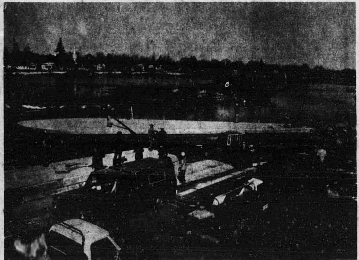
It's in the Flat River and floating proudly. The construction of the new Lowell Showboat is running along smoothly according to contractor Ivan Blough. The pontoons with the deck completed, was launched last Saturday morning and construction of the superstructure began early this week. The pontoons and deck as pictured above, weigh approximately thirteen tons and draw about twelve inches of water. The completed boat is projected to weigh 66,000 pounds and draw 23 inches of water; these figures include an average load of 150 people. The construction is taking place at the old dock, not at the new one as was reported in last week's Ledger.