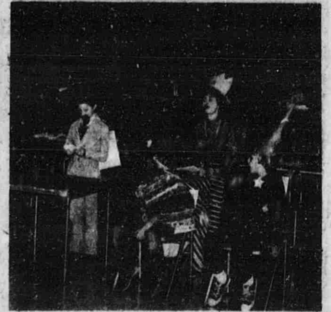
Parents were astounded at their tricky offspring at the March 20 meeting of Lowell Cub Scouts and Webelos. The Scouts planned and performed their own magic show and the Webelos made puppet magic with their individual creations.