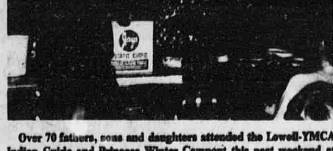
Over 70 fathers, sons and daughters attended the Lowell YMCA Indian Guide and Princess Winter Campout this past weekend at the Boy Scout Cabin.