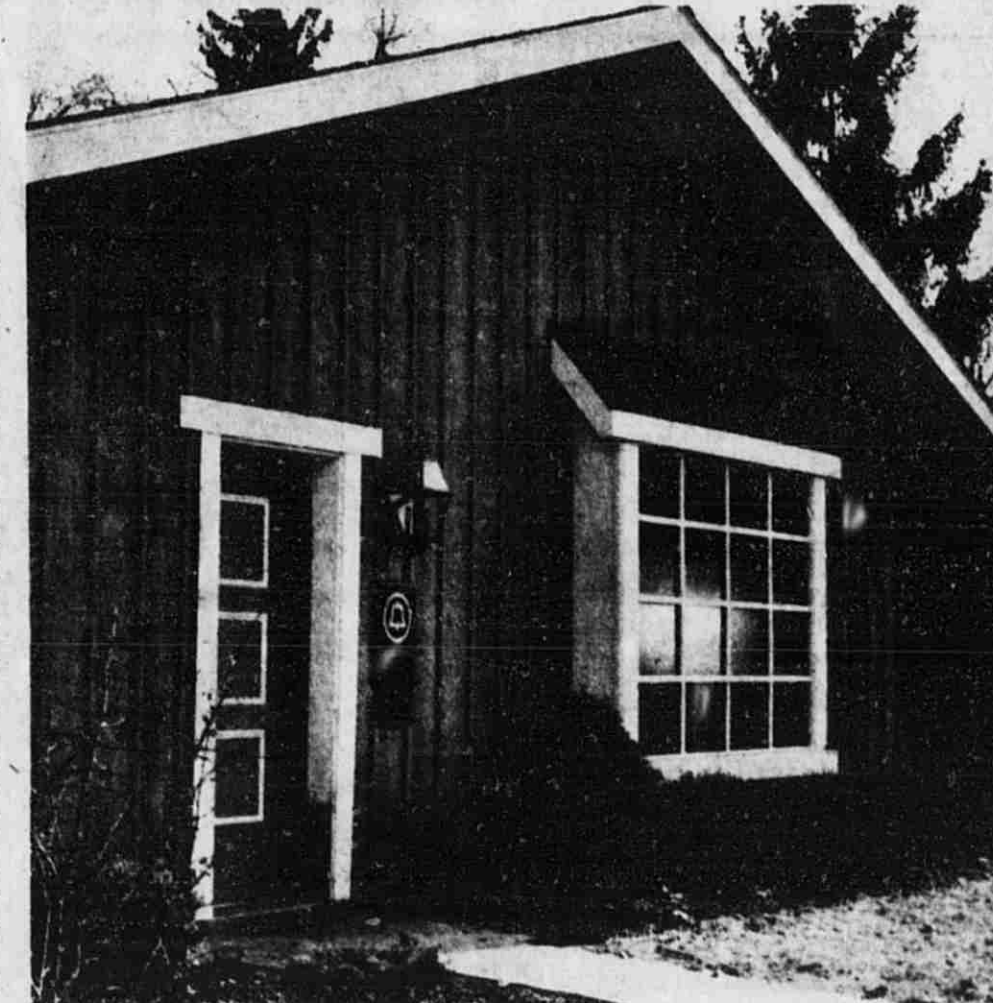
Ada's new electronic central office on Thornapple River Drive has

Thole also noted that when the electronic central office goes into operation Dec. 16, five-digit dialing within Ada will no longer be possible. All seven digits will have to be dialed.