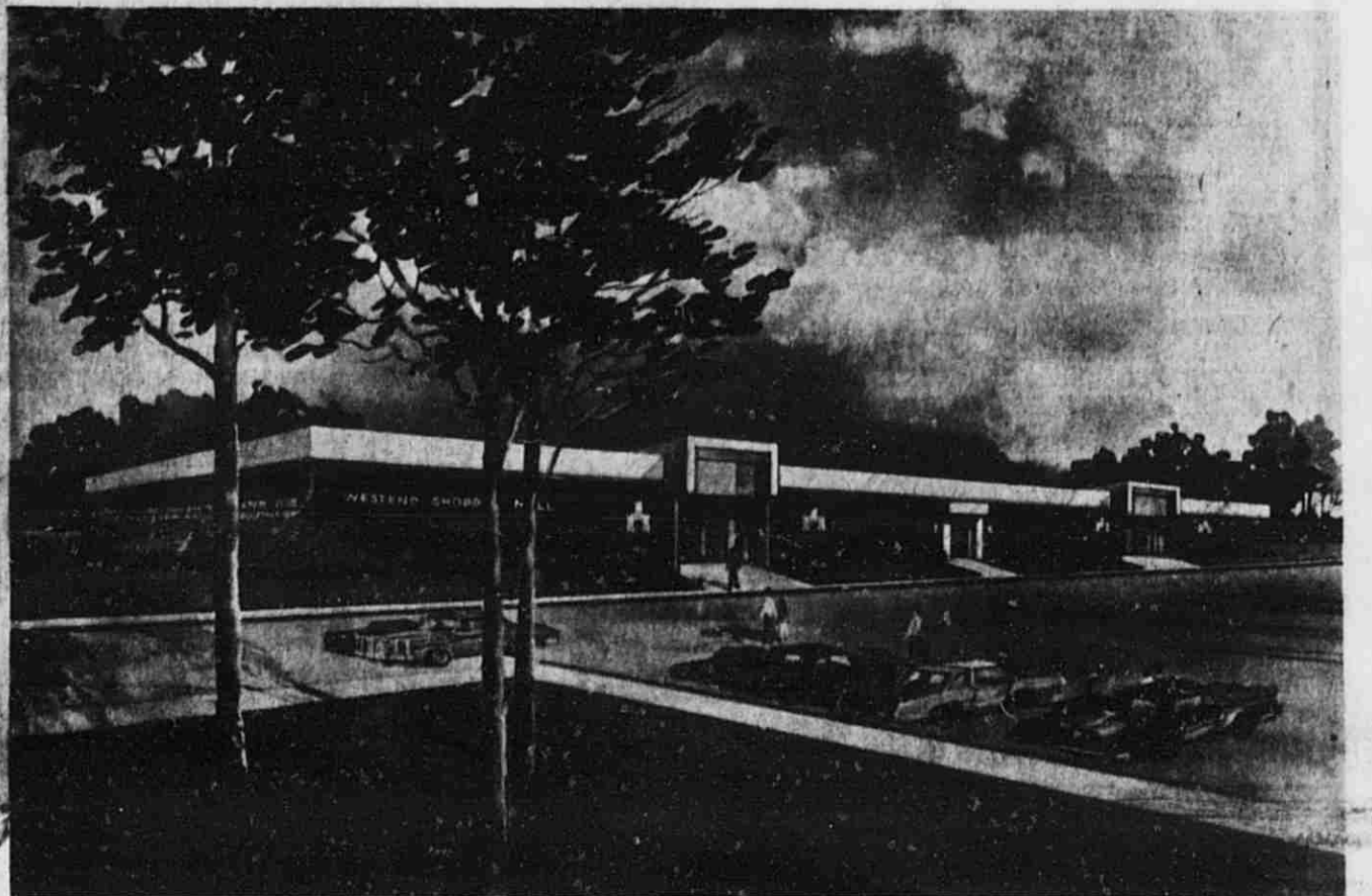
Construction is scheduled to begin in May on the million dollar Westend Shopping Mall designed by Faber and Associates of Grand Rapids. The structure, promoted by Dr. Harold R. Myers of Lowell, will be located on Lowell's West Main Street, between Curtis' Laundromat and Thomet Chevrolet.

A big step forward is ahead for Lowell with the coming construction of a one-stop shopping mall near the western limits of Main Street. The first phase of the building program will contain 50,000 square feet and house 12 stores. It will be of masonry and steel construction with three main outside entrances. A landscaped park setting will enhance the beauty of the structure, according to Dr. Harold R. Myers and Virginia L. Myers, co-owners of the project, and paved parking for 263 vehicles will be installed. To be located on the south side of Main Street, between Thomet Chevrolet and Curtis Laundromat, the main entrance will be off from Main Street with another access from Bowes Road. The building site of seven acres will leave adequate room for further expansion if necessary. When interviewed early this