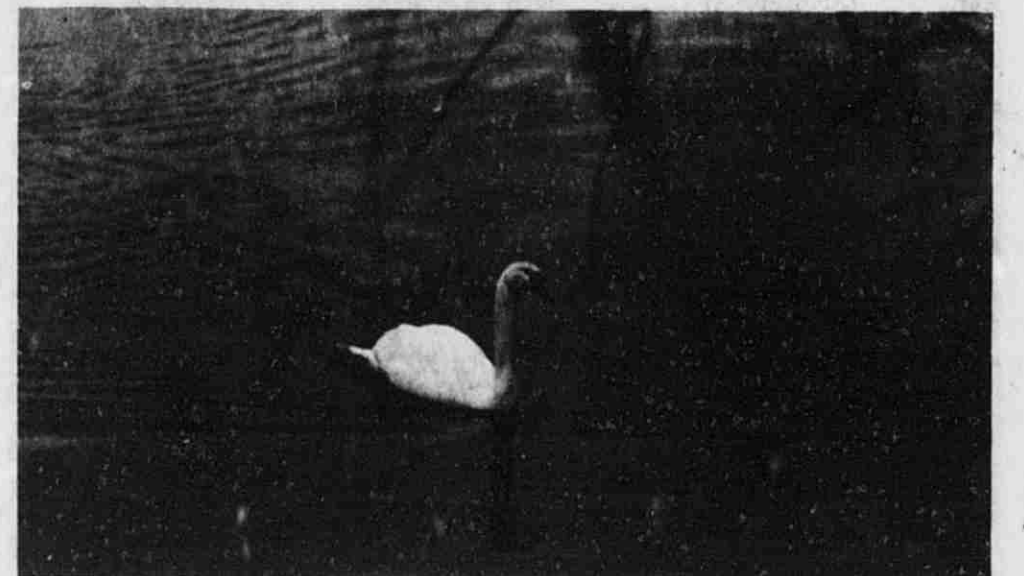
Lowell residents have been treated to the sight of a large white swan that has at least temporarily made its home on the Flat River. Local sources indicate that swans have stopped here for short periods in past years but do not stay long. A call to the Department of Natural Resources did not turn up much information about swans except that they are not rare to the area.

FARMERS PLAN INCREASES FOR SOYBEANS AND OATS Michigan farmers have expressed intentions to plant considerably more acres of dry beans, soybeans, and oats this spring, according to the Michigan Crop Reporting Service. However, there is more uncertainty this winter as to actual spring plantings. This is due to lower farm prices and increased unrest among farmers. APRIL SPECIAL — Save those priceless old family pictures! We can copy and/or restore them to better than new condition, even if cracked and torn. For the month of April, a discount of 20% will be given on all copy work. For a free estimate, bring your treasured old photos to Modern Photographics, 104 W. Main St., Lowell, or call 897-5606 for a brochure and price list. c22-24