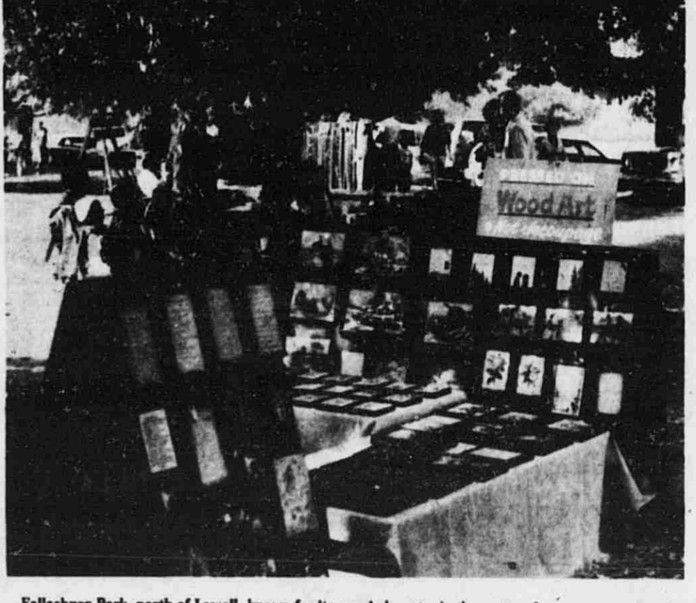
Fallsburg Park, north of Lowell, known for its scenic beauty, is the scene of many arts and crafts shows during the summer and in the early fall. Besides visiting the famous Fallsburg Park Covered Bridge, adjacent to the Park, picnickers can also wade in the Flat River, go fishing, and enjoy the many recreational facilities within the park.

Reservations can be made by telephoning the park department-774-3697-- weekdays between 8 a.m. and 4 p.m. —