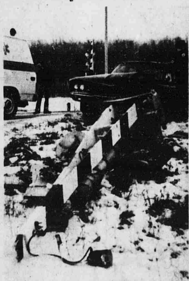
Two persons were injured Friday when the car in which they were riding veered out of control and struck the crossing signal at the Grand Trunk railroad tracks on South Hudson Street. Treated at the scene were Clair Barnum and the driver of the vehicle Mary Orcutt.