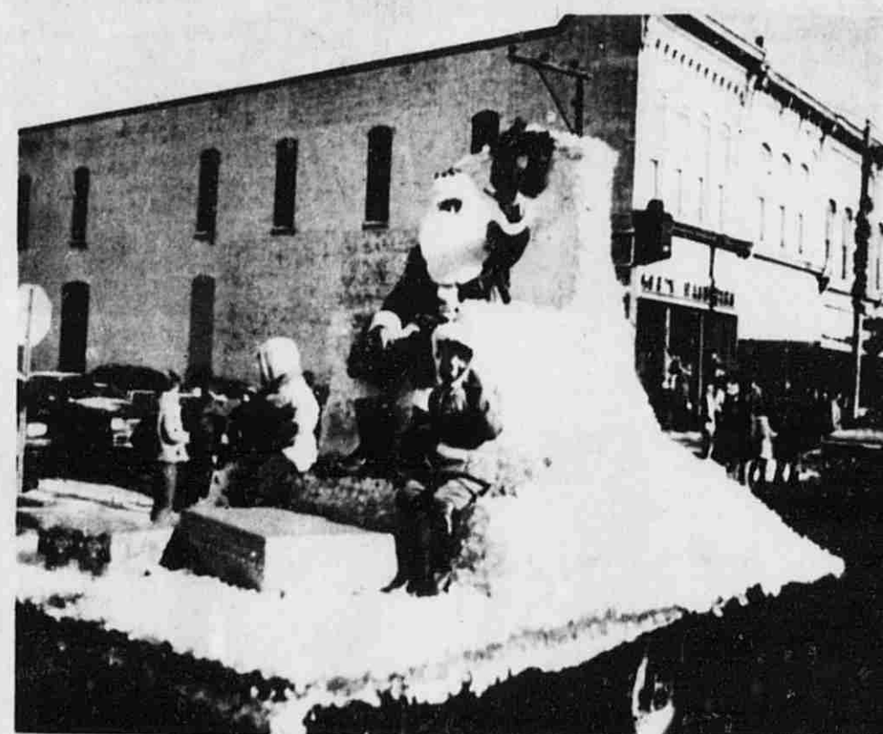
Santa Claus came to Lowell last Saturday for the city's annual Christmas Parade. Riding a new float, Santa was accompanied by the Lowell High School Band, Lowell Middle School Band, fire trucks, clowns, Winnie-The-Pooh, Kermit The Frog, Camp Fire Girls, and other assorted units. The parade is sponsored annually by the Lowell Area Chamber of Commerce.