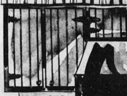
EARLY AMERICAN HARVEST

The beauty and convenience of a new kitchen provides lasting enjoyment for your family