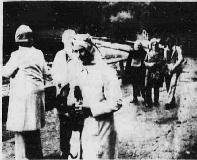
Despite the rainy weather, a group from the Lowell Senior Neighbors Center walked through the Kellogg Bird Sanctuary.

Meals are served at the Center at noon on Monday through Friday. Any person who is a resident of Kent County and over 60 years of age is eligible; reservations must be made on the preceding day, before 2 p.m., by calling 897-5250. Other Center services, including transportation, recreation, information, referral and counseling are partially funded by United Way.