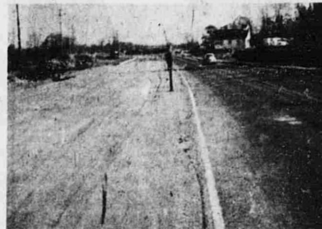
The two eastbound lanes, above right, of the four-lane, M-21 between Int. 96 and the railroad tracks have been completed, but the westbound lanes, left, will not be blacktopped until next spring. The white building, upper right, is the vacant, 107-year-old Collins School.

A great deal of work between Int. 96 and the railroad tracks has been completed since it was