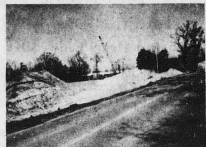
The north end of Forest Hill Ave., above, will be relocated to swing northwesterly to the new M-21. The new lanes will be laid between the two mounds of sand, left and center.