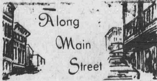
Along Main Street

For current information on smelt runs, steelhead runs, etc., you can call the "Fishing Hot Line" in Lansing at 517-373-0908.