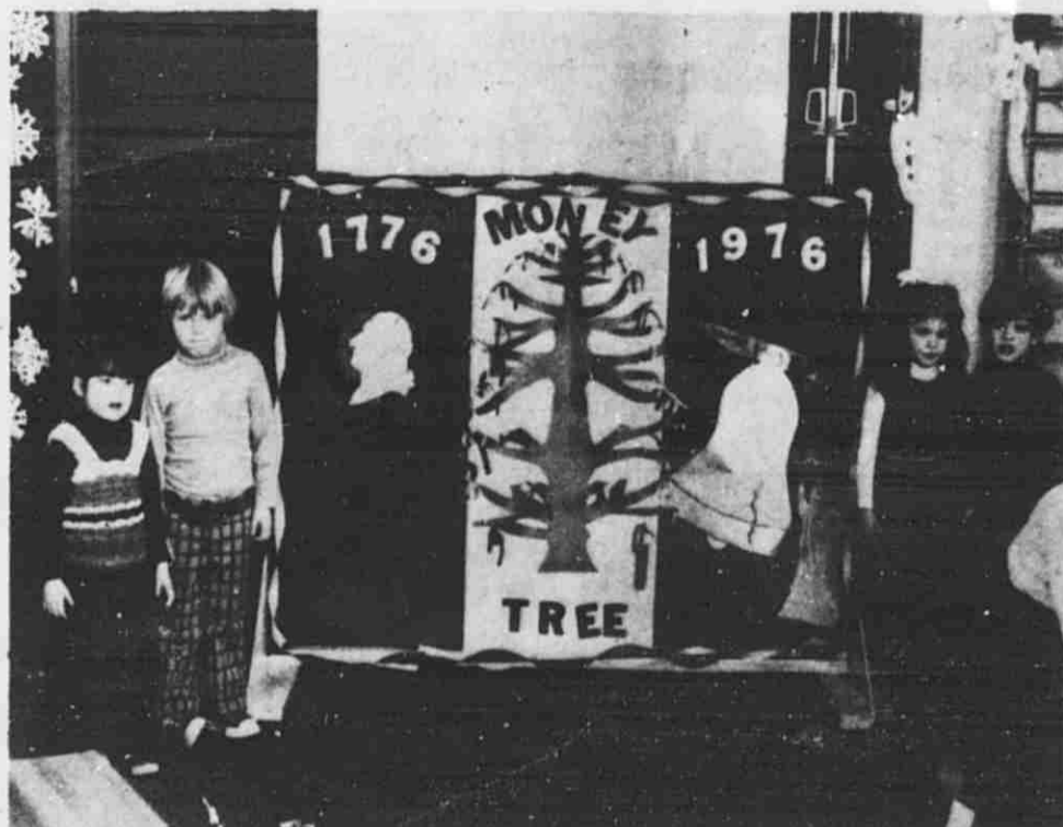
Lowell Area School's "Headstart" class has been exceptionally busy lately, as they are attempting to undertake one money making project per month.

The current project will see some lucky person winning 25 Bi-centennial silver dollars. The winning name will be revealed February 27.