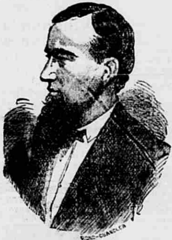
None Genuine unless signed by