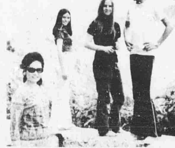
Friends, Kumusta Mabuti, or in English... Hi, I'd like to welcome you all to my travelogue on the "Philippines" Monday, February 4, at 8 p.m. in the High School Auditorium.

As a final indicator, when our school was host to the district choir evaluation, the administration could not take themselves away from their "Christmas Party" to make even a token appearance.