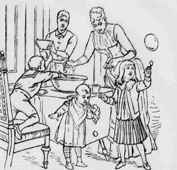
When children gather in delight, To fill the air with bubbles bright, Of this it parents all be sure— The soap they use is good and pure...