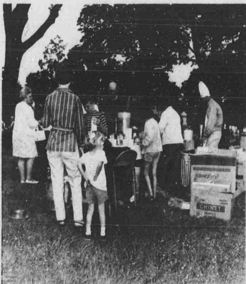
The gigantic Chicken barbecue in Lowell's Richards Park benefitted the Thornapple Valley Little League football program. Several hundred hungry people attended the event last Saturday afternoon.