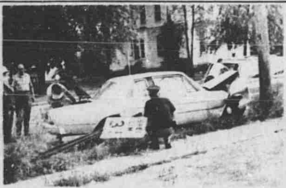
CRASH, CRUNCH, TUMBLE - At left, a car driven by a Lowell man ran off Lincoln Lake Road and flipped. He was uninjured. Above, Lowell woman was taken to a Grand Rapids hospital and later released after she rammed a utility pole on Main Street. At right, a semi trailer jack-knifed on Bowes Road - but the driver escaped uninjured. So, YOU drive carefully.