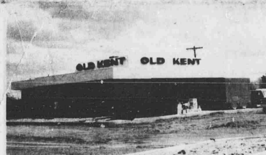
CASCADE BRANCH OF OLD KENT BANK NEARS COMPLETION

time groups interested in reserving a booth should have at least one representative present. Others who plan to help are asked to be in attendance.