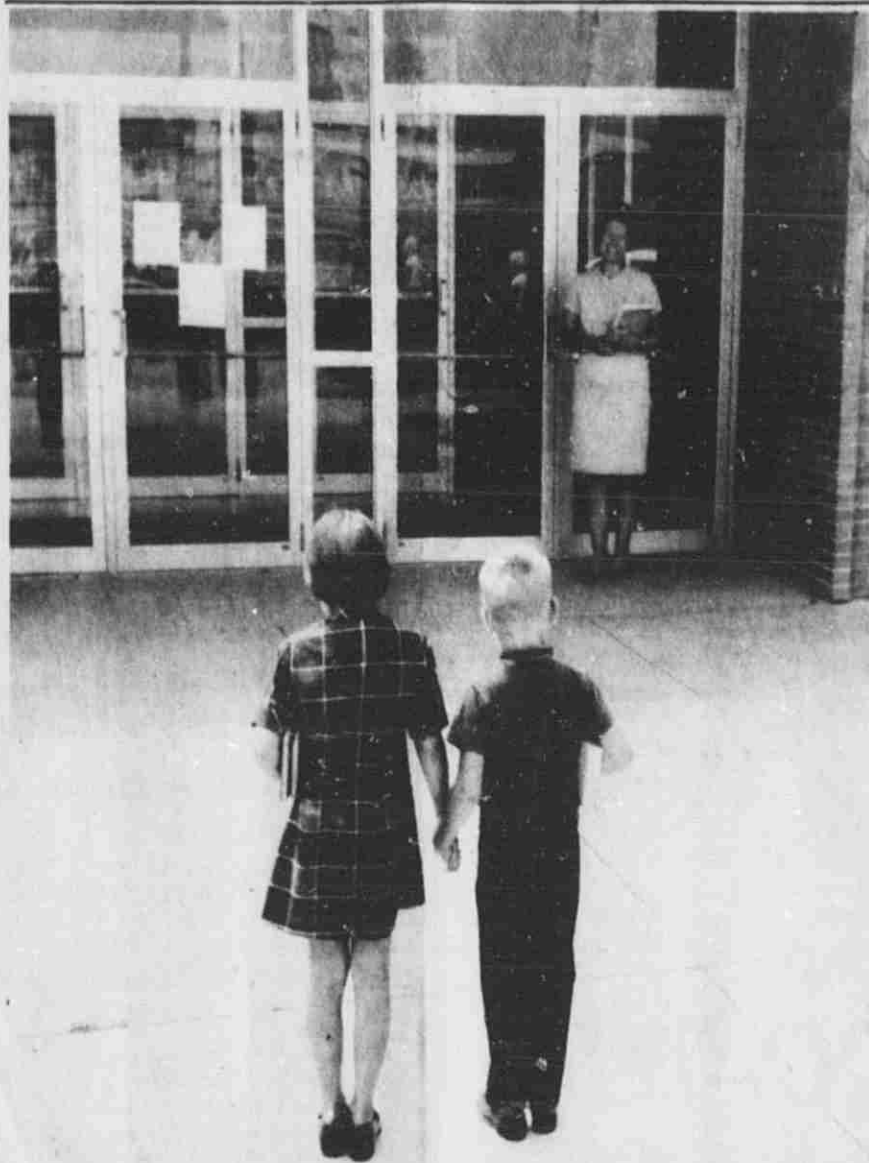
BELLS ARE RINGING — Classrooms re-opened this week throughout the area, beckoning children to school. It's a whole new experience for those attending kindergarten, such as the two pictured above.

To augment the plan, the agreement calls for a maximum expenditure of $15,000 to those who successfully meet the requirements in the first year and a maximum of $20,000 expenditure in the second year.