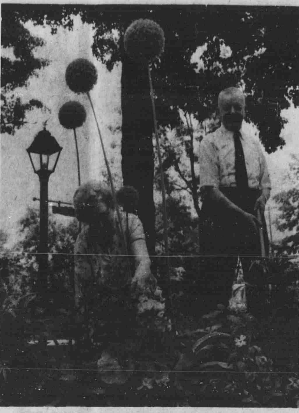
FLORAL DELIGHT — A rare species of "cathartid wildflower", known as the Jewel of Tibet, is in full bloom at the home of Mr. Gerrit Baker on Thorpe Apple River Drive. The flower is described as lilac in color with blooms six to eight inches across on stems rising five feet or more.