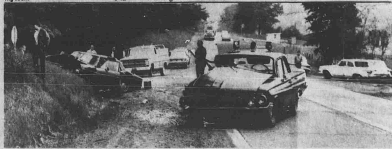
PROBE ACCIDENT - Kent County Sheriff's officers are investigating this accident in which two persons were injured, neither seriously, on 'Accident Alley' Monday morning. This was the scene at M-21 and Alta Dale, west of Ada. (See page 2)

TOOT! One can't help but wonder what will happen the first time the Robert E Lee XXXVII comes 'round Cattail Bend . . . with our good friend the swan, who has had the river pretty much to himself this spring.