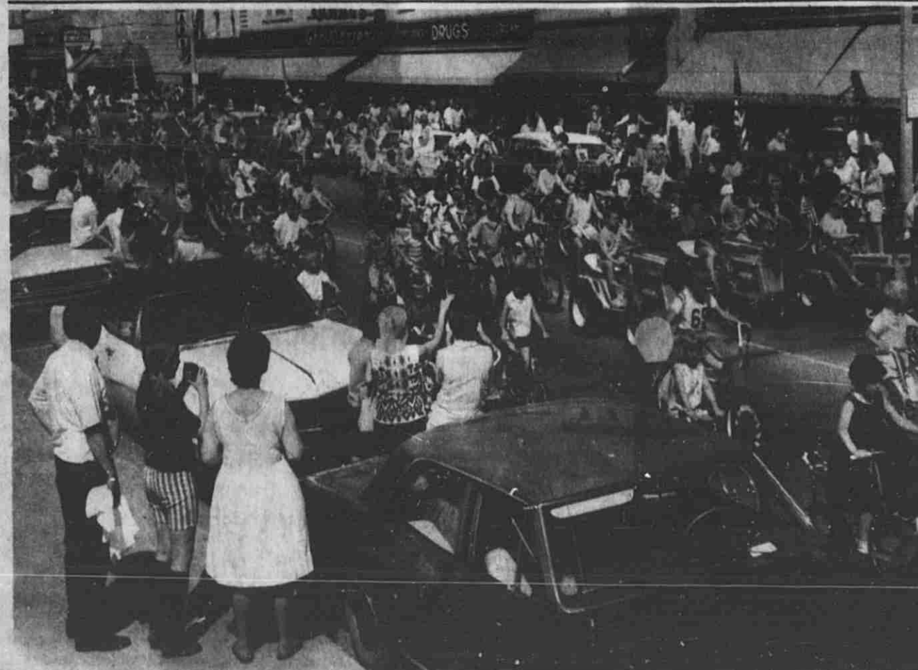
EVERYBODY LOVES PARADE - Bicycles, bicycles, bicycles... and a few small tractors thrown in for good measure... bring up the rear during the annual Memorial Day parade on Main Street in Lowell. There were plenty of marchers and viewers under warm sunny holiday skies.

Donations are needed for the Annual Ada Firemen's Auction to be held June 6. Contact any fireman for pick-up. Proceeds for July 4th Fireworks. c-9