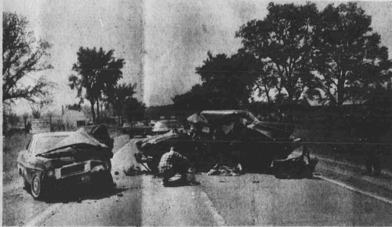
CR-R-R-R-RUNCH! A head-on crash on M-21 in Lowell Monday sent one driver to the hospital in serious condition and resulted in serious injuries to four other persons. The scene above shows closeup of car driven by Eugene Randall of Saranac, which reportedly veered out of control as the driver reached for a cigarette. Randall's car struck one vehicle, then plowed head-on into an auto driven by Robert Jackson of Wayland (above right). The picture below shows new speed limit sign of 50 miles an hour. . . posted at the accident scene just three days earlier when speed was increased from 45 m.p.h.