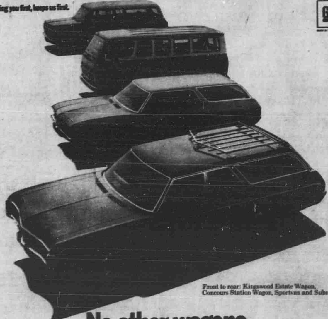
Front to rear: Kingswood Estate Wagon, Concours Station Wagon, Sportvan and Suburban.