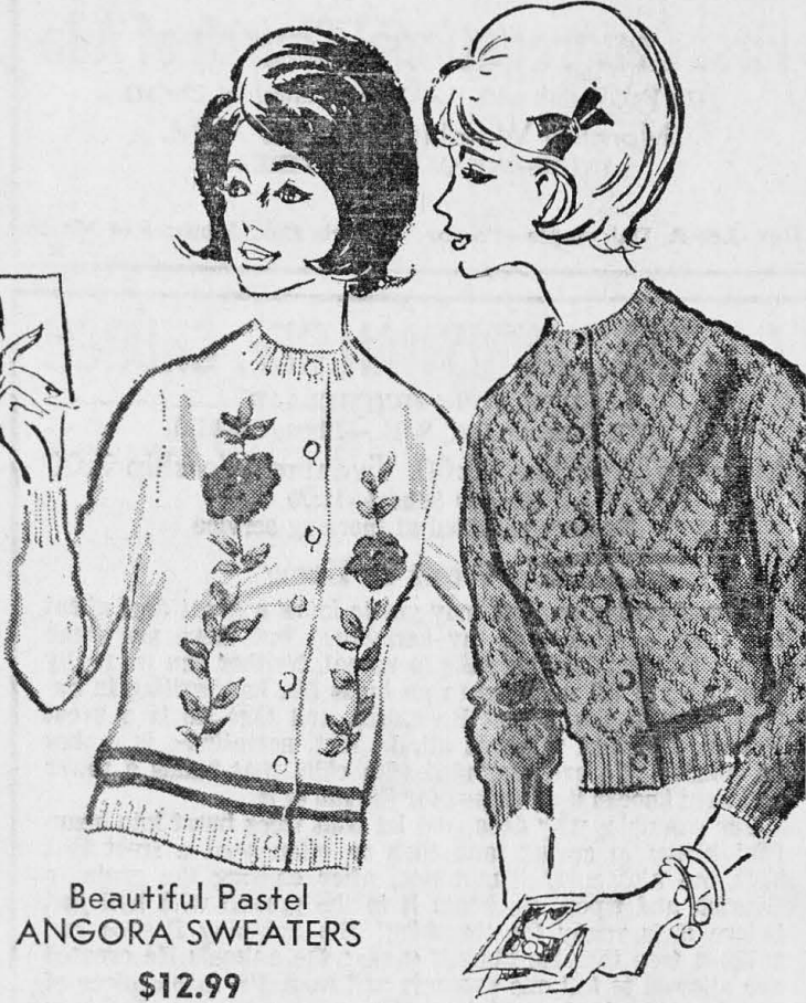
Beautiful Pastel ANGORA SWEATERS $12.99