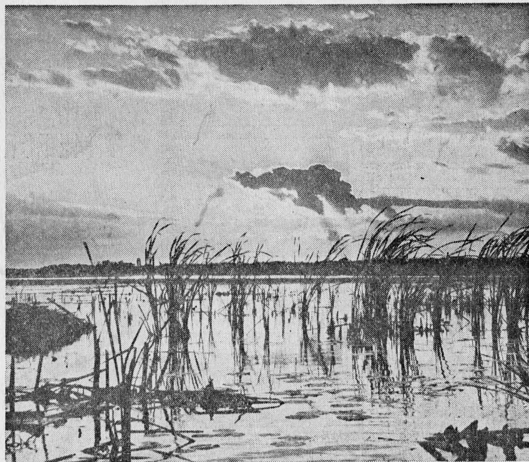
I am a bedlam of noise. I am dumb with silence. I am life giving. I am murderous. I am home to graceful birds and to countless crawling, slithering, swimming creatures. I am cursed by men, and extolled by men. I am repulsive and I am beautiful. Among earthly things I was the beginning. There are those who say I will be the end.....I am the marsh.