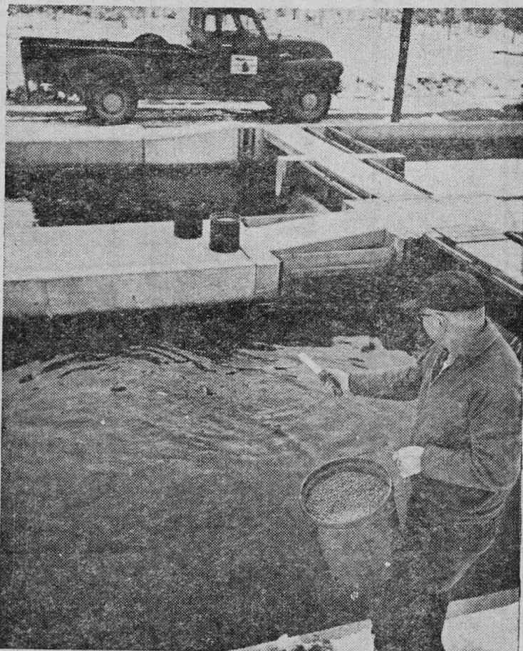
It's feeding time at the Conservation Department's Wolf Lake fish hatchery as some hungry trout get a serving of dry food pellets. Development of this pelleted fish food has doubled fish plantings because the new food produces faster growth at less expense than former methods. During 1957, some 2,560,000 hatchery trout were released in Michigan lakes and streams.