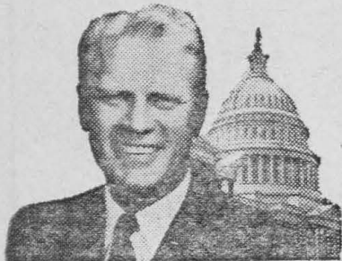
by Congressman JERRY FORD

President Eisenhower has submitted a bold and surprisingly far-reaching proposal for the reorganization of the Department of Defense. Ike has definitely "grabbed the ball" and assumed the leadership in suggesting ways and means to improve the operations of the Defense establishment.